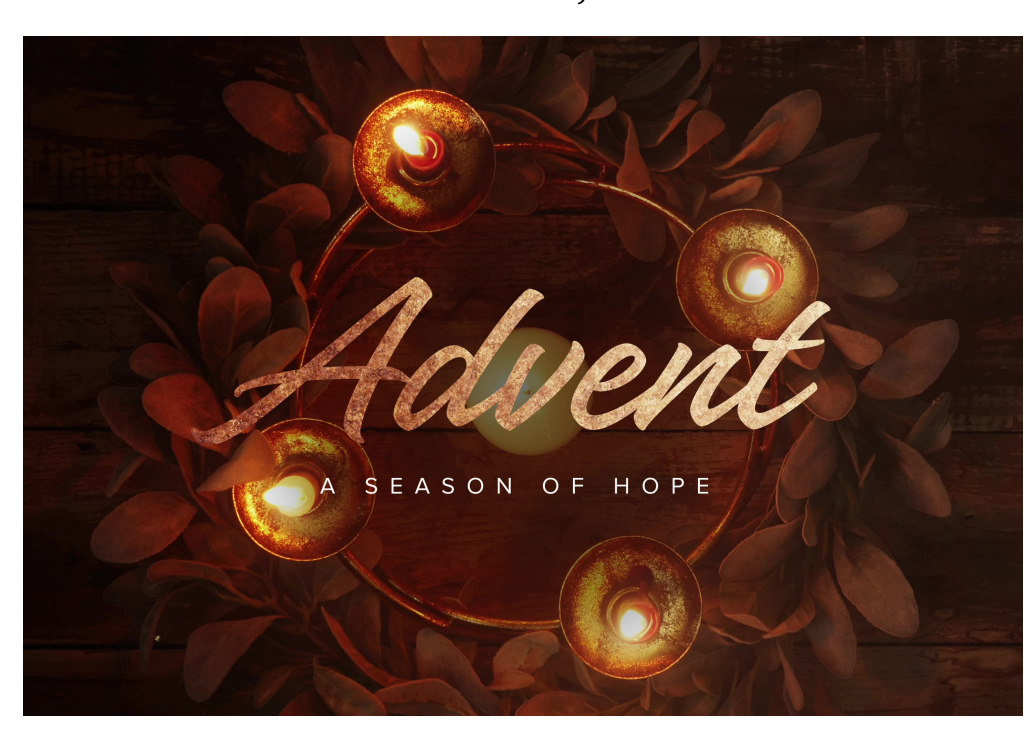
To our Guests, Welcome!

As you settle in, you can expect to experience a worship service that consists of music, giving and Biblical teaching. Please let us know how we can assist you in your spiritual journey. If you're new here, scan the QR code on the back of the bulletin to fill out the Welcome card online!